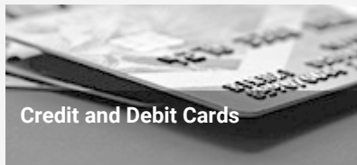
Credit and Debit Cards